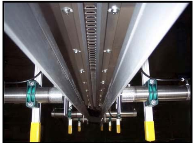
AIR CONVEYOR WITH NECK GUIDE

The force transferred to products being moved by the air is quite low and controllable. It varies based on the application, but generally it will not deform items under accumulated line pressure. For example, if a conveyor is moving a thin, 12-gram PET water bottle, the total force of the air pushing on