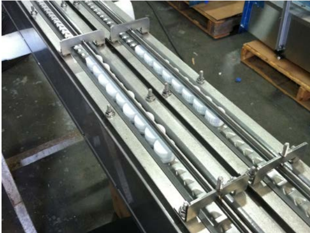
A dual-lane air conveyor uses a top bar cover to keep the bottle caps from leaving the line as they move along.

last a year before needing to be replaced. Newer HEPA filters work with minimal pressure drops, so blower efficiency is still maintained. Because there are minimal moving parts and no pockets to collect water and debris in air conveyors, they are easy to keep clean—another key advantage for aseptic uses.